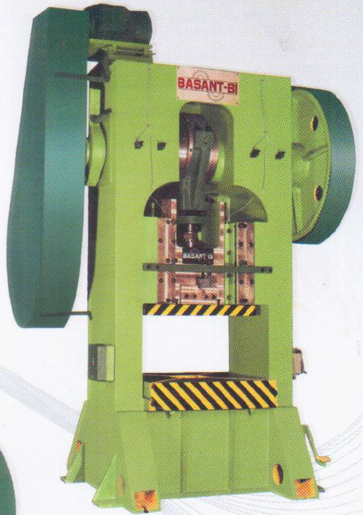
H-Frame (Pillar Type) Power Presses with Mechanical Rolling Key & Air Friction Clutch